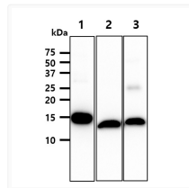
Western blot of human FABP1 L-FABP protein using STJA0041894 antibody