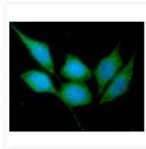
Western blot of human CACYBP antibody STJA0041697 protein detection