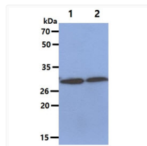
Western blot of human MEMO1 antibody showing U87MG and mouse brain lysate detection