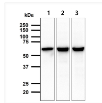
Western blot of Human HSP60 antibody in 293T HeLa and A549 cell lysates