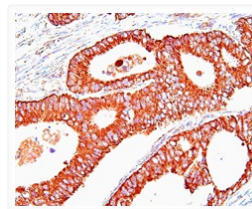
Human HSP60 antibody IHC staining in paraffin-embedded colon cancer tissue with DAB detection