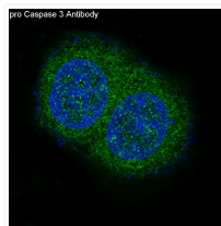
pro Caspase 3 Antibody immunofluorescence MCF-7 STJA0036080