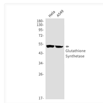
Glutathione Synthetase antibody western blot HeLa A549 STJA0035210