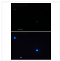
CD79a antibody immunocytochemistry HL-60 cells STJA0034147

Note STRICTLY FOR FURTHER SCIENTIFIC RESEARCH USE ONLY (RUO). MUST NOT TO BE USED IN DIAGNOSTIC OR THERAPEUTIC APPLICATIONS.