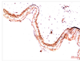
PDGFR alpha antibody immunohistochemistry human tonsils STJA0032929