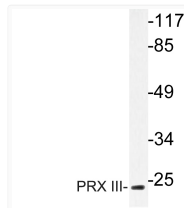
Western blot analysis of lysate from HeLa cells, using PRX III antibody.