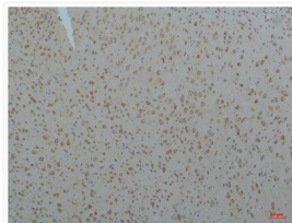
Immunohistochemical analysis of paraffin-embedded mouse Brain Tissue using Cav pan \alpha 1 Rabbit pAb diluted at 1:200.