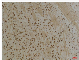
Immunohistochemical analysis of paraffin-embedded mouse BrainTissue using Kv10. 1 Rabbit pAb diluted at 1:200.