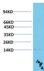
Western blot analysis of Human Serum using TTR Mouse mAb diluted at 1:2000