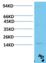
Western blot analysis of Human Serum using TTR Mouse mAb diluted at 1:2000