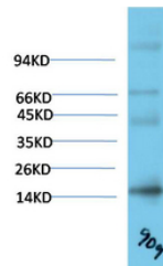
Western blot analysis of Human Serum using TTR Mouse mAb diluted at 1:2000