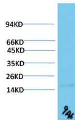
Western blot analysis of Human Serum using TTR Mouse mAb diluted at 1:2000