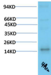
Western blot analysis of Human Serum using TTR Mouse mAb diluted at 1:2000.