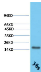
Western blot analysis of Human Serum using TTR Mouse mAb diluted at 1:2000