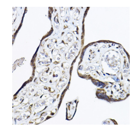
Immunohistochemistry of paraffin-embedded human placenta using PAPD7 rabbit polyclonal antibody (STJ112057) at dilution of 1:50 (40x lens).