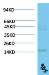
Western blot analysis of Human Serum using TTR Mouse mAb diluted at 1:2000