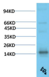
Western blot analysis of Human Serum using TTR Mouse mAb diluted at 1:2000