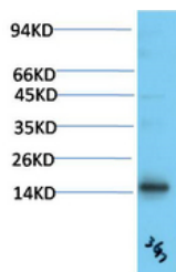
Western blot analysis of Human Serum using TTR Mouse mAb diluted at 1:2000.