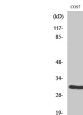
Western blot analysis of various cells using CD40 Polyclonal Antibody

This product is suitable for in-vitro studies under the RESEARCH USE ONLY [RUO] licence. This product must not be used as for diagnostic or other medical purposes. St John's Laboratory Ltd, Knowledge Dock Business Centre, University Way, London, E16 2RD | Tel: 0208 223 3081